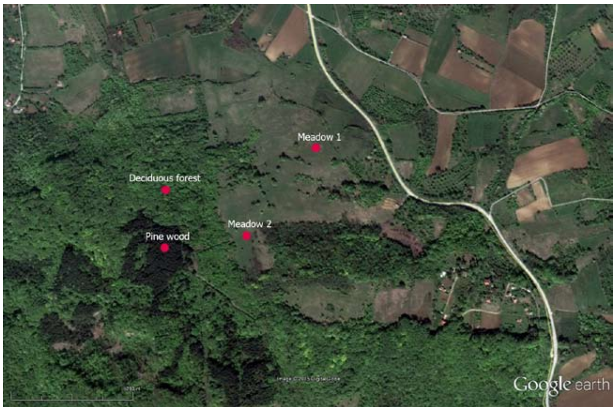
Fig. 1. Map of locality Erdelj (Fruška Gora Mt.) with sampling plots in 2010

The spiders were collected with pitfall traps. The traps were made of 2 dcl plastic juice cups, with an opening with diameter 6.5 cm and height 8.5 cm, half filled with vinegar, protected against rain with a roof of opaque plastic film (Fig. 2). Eight traps per plot were placed in a line, with 10 m distance between the traps. The exception was the plot Meadow 1 where 16 traps were placed, because of the larger size of the area and the expected high loss of traps due to sheep trampling. The traps were emptied weekly. The sampling period began on 30 April 2010 and it was aborted on 8 August 2010 due to high rates (60%) of trap destruction by trampling. The collected specimens were preserved in 70% ethanol. Determination of species was largely based on the Araneae – Spiders of Europe website (NENTWIG et al. 2015). The available literature for individual groups or species was also used but it was only mentioned where species were discussed. The nomenclature used followed The World Spider Catalogue (WSC,