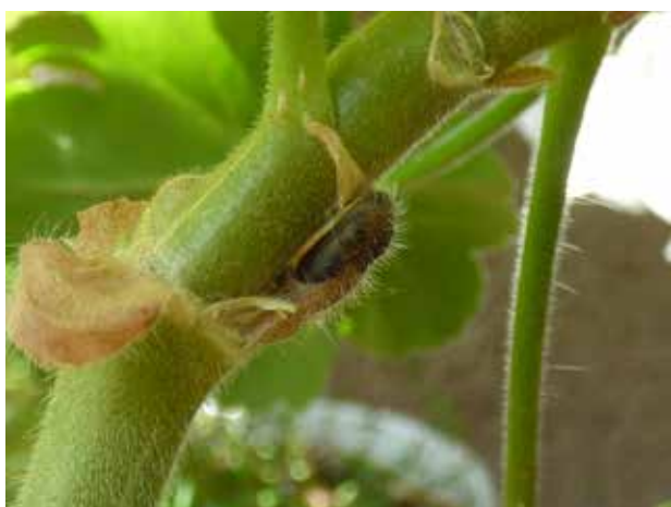
Fig. 6. A chrysalis of the Geranium Bronze, C. marshalli