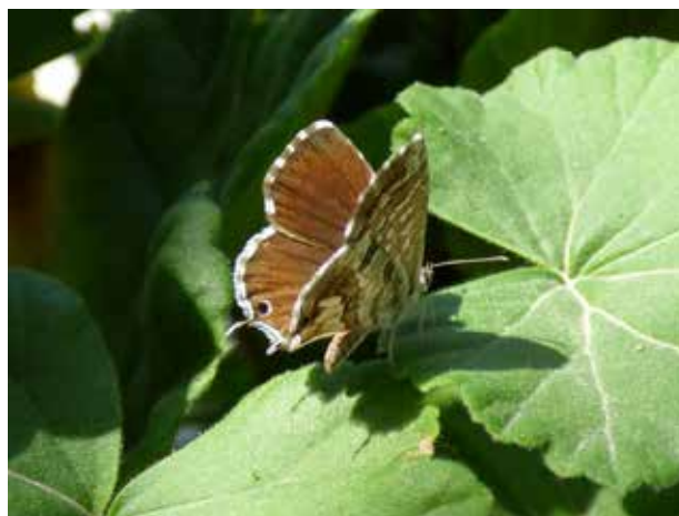
Fig. 3. A female of the Geranium Bronze, C. marshalli , upper side