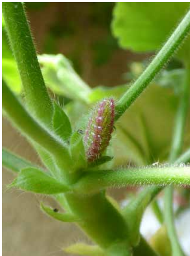
Fig. 5. A caterpillar of the Geranium Bronze, C. marshalli

this species (in the literature and the Internet), it has been recorded so far in about 150 UTM-grid zones (10x10 km) in the Balkan Peninsula and Turkey (Fig. 1). Most of the recorded localities are along the