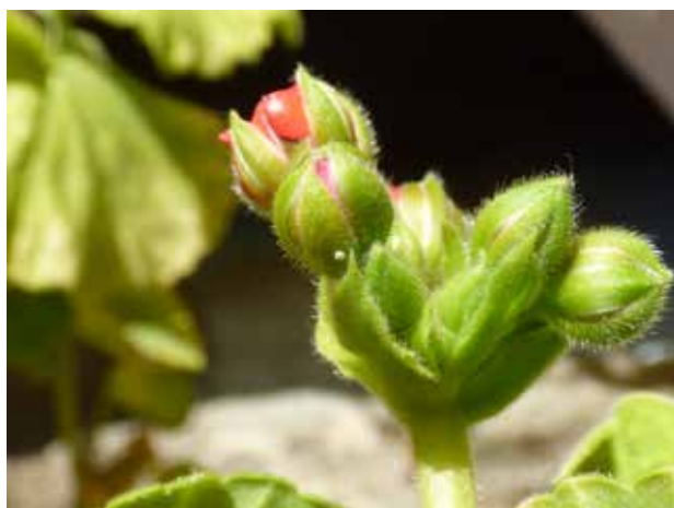
Fig. 4. An egg of the Geranium Bronze, C. marshalli