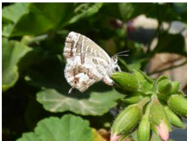
Fig. 2. A female of the Geranium Bronze, C. marshalli , ovipositing on Pelargonium sp.