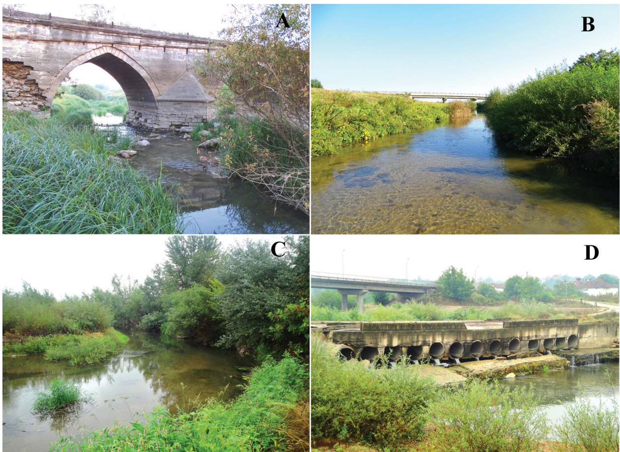
Fig. 1. Habitats of Faxonius limosus in Bulgaria. (A) Locality of the first finding of the species in the Toplovets River near Vidin Town; (B) Voinishka River at Dunavtsi Village; (C) Archar River downstream of Archar Village; (D) Archar River – a weir formed by the destroyed old bridge, separating populations of F. limosus (downstream of the bridge) and Pontastacus leptodactylus (upstream of the bridge).