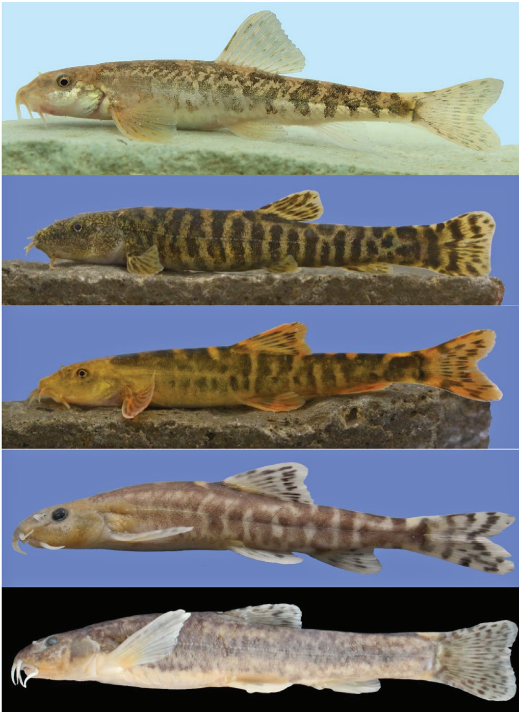
Fig. 1. Lateral view of (from top to down) Oxynoemacheilus bergianus (Sarısu Stream, Aras River), Oxynoemacheilus cyri (Balcesmeh Stream, Kura River), O. brandtii (Derinöz Stream, Kura River), O. bergi (Balcesmeh Stream, Aras River) and O. veyselorum (Bozkuş River, Aras River).