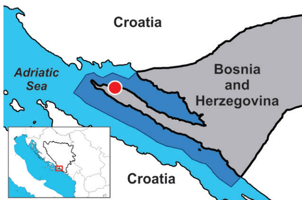
Fig 1. The Neum Bay (Klek Peninsula, Bosnia and Herzegovina), with a red dot highlighting the locality where Elysia timida (Risso, 1818) was found.

The specimen hereby reported was collected, during daytime, on the 28 th February 2021 in the Neum Bay (Klek Peninsula, Bosnia and Herzegovina), at the outskirts of the Opuće