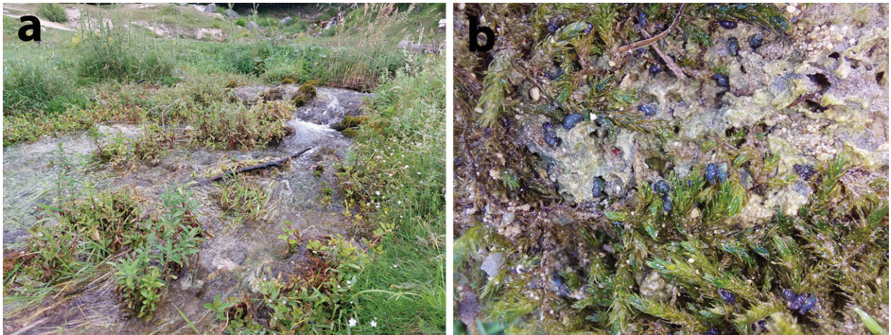
Fig. 2. Sopotnica locality: a, habitat; b, snails at the locality.

pressure related to tourism (picnicking, sightseeing and bathing). Luckily, as for now, there were no wastewater or garbage disposal. The habitat consisted of tufa limestone covered by algae and aquatic mosses. Many small springs emerging from the tufa limestone were connected with the river (Fig. 2a). An abundant population of snails was found on the algal cover and in limestone crevices (Fig. 2b).