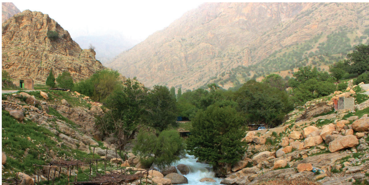
Fig. 3. Type locality of Leptologia malaqai sp. n., near Malaqa Village, Khuzestan Province, Iran.

of the Agrochola generic complex in the Witt Catalogue vol. 9, Xyleninae I. by RONKAY et al. (2017) is as follows: the female genitalia of Leptologia lota (Clerck, 1759) and the close relative Sunira circellaris (Hufnagel, 1766) were transposed. Correctly, Fig. 63, p. 259 is the female genitalia of S. circellaris , and Fig. 66, p. 262 is that of L. lota (see also Figs. 2B, C, D in this paper). To correct this error, the present authors publish here the figures of a female of S. circellaris and its genitalia (Figs 1D, 2D).