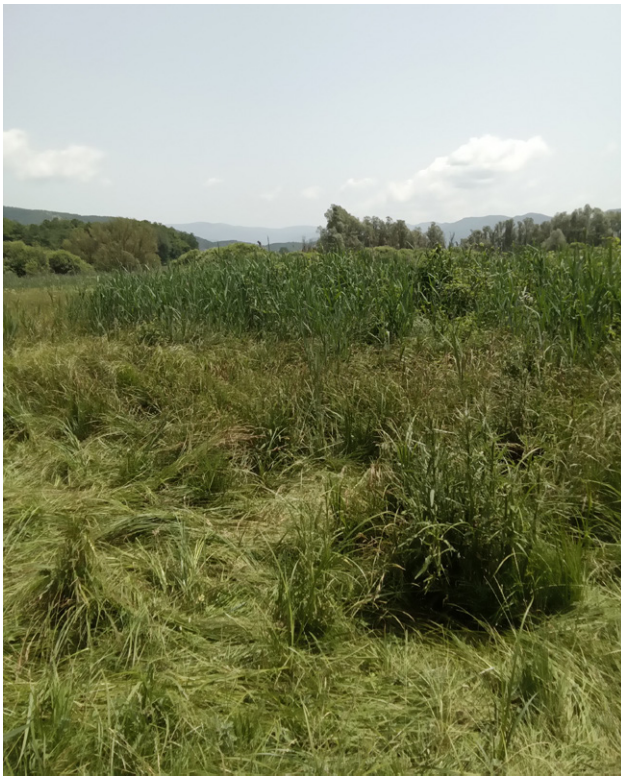
Fig. 1. Belchishko Blato Wetland, June 2023.