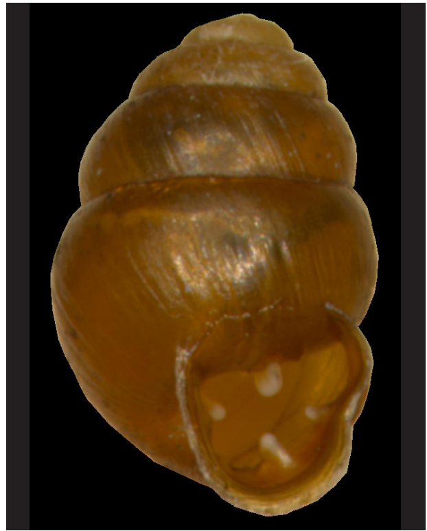
Fig. 3. Vertigo moulinsiana (Dupuy, 1849), a specimen from Belchishko Blato Wetland.