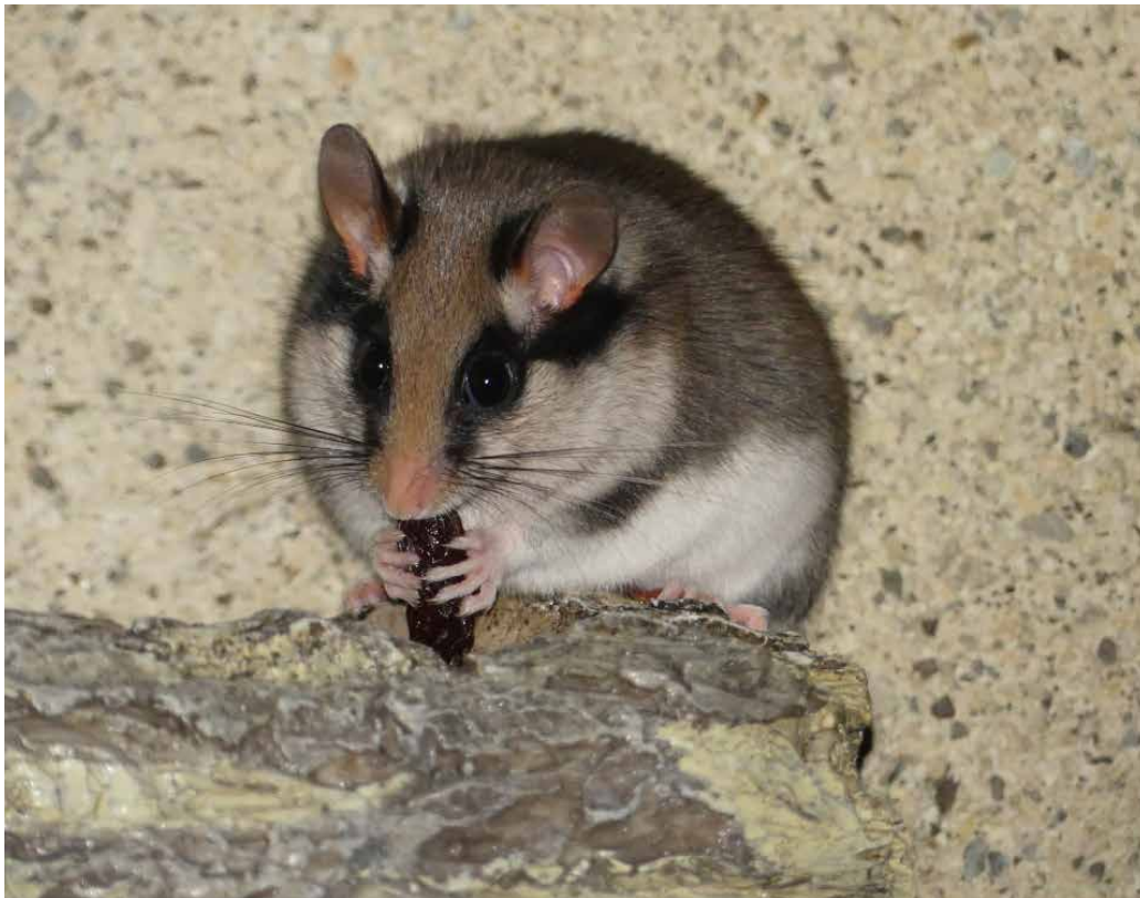
Fig. 2. Garden dormouse photo as proof for an online report of observation.

with different methods without detection. Of course, citizen scientists were keen and happy to detect garden dormice. Fortunately, it was possible to convey that zero counts were just as important as detections of garden dormice. The active searches contributed significantly to confirming the lack of occurrences. We are therefore confident that we have largely captured the general distribution pattern of the garden dormouse in Germany and that only individual small and isolated populations may have been overlooked.