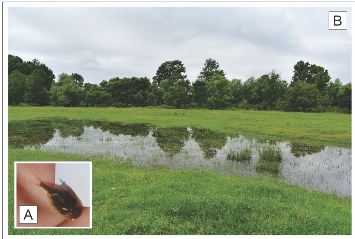
Fig. 3. Triops cancriformis (A) in the village of Bajinci, near the Brzaja River (B) – the habitat corresponds to study site 21.

Cluster IId2 ) were located outside the floodplain. They were colonised by the species Eubbranchipus (Siphonophanes) grubii from February to mid-April. Eoleptesteria ticinensis and Limnadia lenticularis (May-June) also appeared in seasons with favourable hydrological conditions and with the increase of external temperature at some sites (as in puddle 14 from the same cluster).