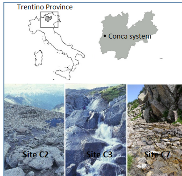
Fig. 1. Study area and pictures of three of the localities where Cernosvitoviella cryophila sp. n. was detected. Site C3 – type locality; sites C2 and C3 – on the glacier-fed stream; site C7 – on the non-glacial tributary.

The study was conducted in the north-east part of Italy in the Trentino Province (46°N, 10°E: Fig. 1). Sampling focused on the glacier-fed stream originating from the Conca Glacier, on the Mt. Carè Alto (Conca Stream) and its main non-glacial tributary. Specifically, nine 15-m sites were surveyed during the 1996-1997 growing seasons: sites C0, C1, C2 and C3 on the glacial reach (kryal); C6 and C7 on its main non-glacial tributary (krenal) and C4, C5 and C8 downstream of their confluence (mixed reach=glacio-rhithral). All sites were sampled during five-day periods on six occasions (late June, early August and mid-September of both 1996 and 1997), except for C1 and C5, which were sampled only in 1996. At each site and date, ten 0.1 m 2 areas (samples Q1-Q10) were sampled using a 0.30 x 0.30 m pond net with a 250- \mu m mesh. Almost 500 samples were collected during the two years. Detailed descriptions of the study area and methods were published by Maiolini & Lencioni (2001). All invertebrates, including oligochaetes, were preserved in 75% ethanol until