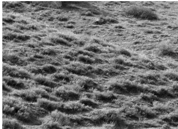
Fig. 3. Steppe dominated by Artemisia sp. Şereflikoçhisar, south of Akın village, altitude 960 m