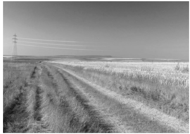
Fig. 6. Agricultural lands, Şereflikoçhisar, Sadıklı, 1060 m