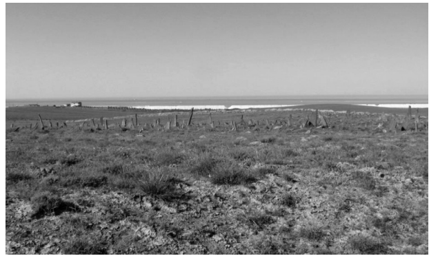
Fig. 2. Halophilous area. Şereflikoçhisar, Hamzalı, 910 m