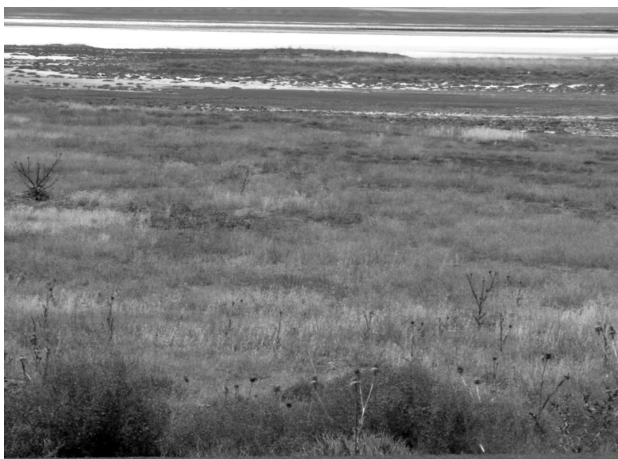
Fig. 1. Halophilous area. Edge of Salt Lake, 20 km north of Şereflikoçhisar, altitude 923 m

- Agricultural areas (Fig. 4): Many areas in the region are more commonly used as dry land farming areas. The northern parts, where the İrfanlı Reservoir is located, are deteriorated. Dominant plant species here are Anchusa azurea , Senecio vernalis , Carduus nutans , Centaurea solstitialis , Xeranthemum annuum and Taraxacum scaturiginosum .