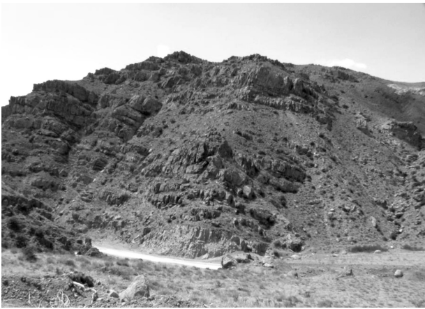
Fig. 5. Stony area between Şereflikoçhisar-Şereflidavutlu road, altitude 950 m