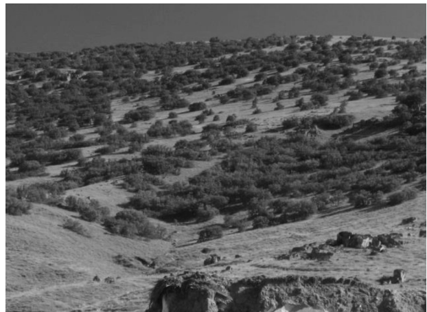
Fig. 4. Şereflidavutlu, 1058 m, oak forest community

- Rocky and stony areas (Fig. 5): Poor vegetation areas dominated by rocks and stones are included in this group. Dominant plant species here are Amygdalus orientalis , Astragalus microcephalus , Reseda lutea and Rhamnus sp.