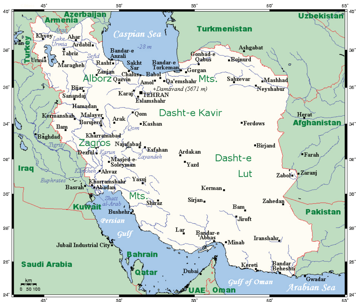
Fig. 1. Map of Iran showing the cities where samplings were conducted.

(1998, 1999, 2003, 2010). Data about classification, nomenclature and distribution are according to BOROWIEC & SEKERKA (2010) for the Cassidinae, SCHMITT (2010) for the Criocerinae, SILFVERBERG (2010) for the Donaciinae, MOSEYKO (2010) for the Eumolpinae, and BEENEN (2010) for the Galerucinae. The Iranian provinces are shown in Fig. 1.