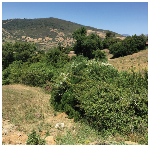
Fig. 2. Surrounding landscape at El Hamma. Photo K. Kettani, 6 June 2016.