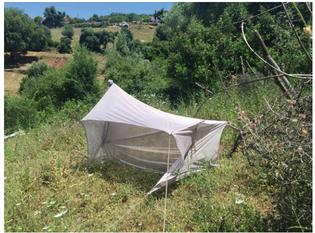
Fig. 1. Larache Province, El Hamma: Malaise trap at the type locality of Chrysotus larachensis sp. n. Photo K. Kettani, 6 June 2016

Type material. Holotype: ♂, Morocco, Larache Province, El Hamma, 35°23'05"N, 5°30'46"W, 338 m a.s.l., 6–21 June 2016, Malaise trap, K. Kettani Coll. [ZIN]. Paratypes. 5♂, 9♀, same label [ZIN; Institut Scientifique, Université Mohammed V – Agdal, Rabat; Faculté des Sciences, Université Abdelmalek Essaâdi, Tétouan].