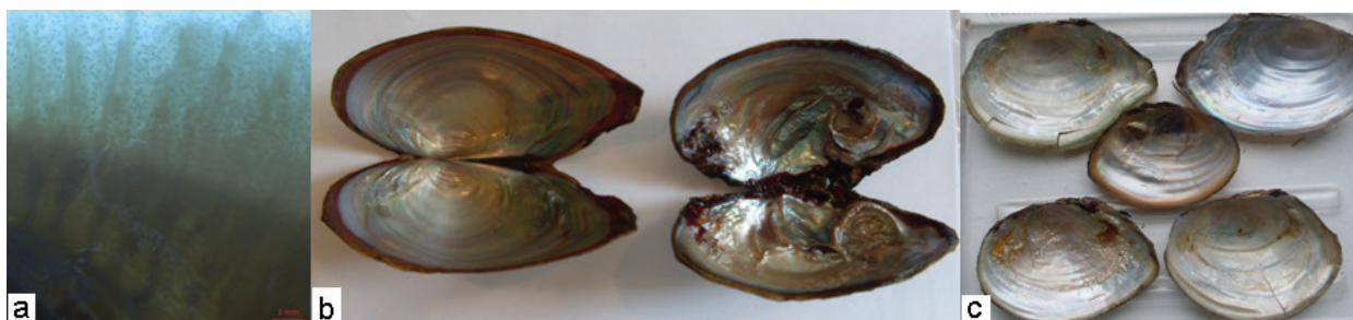
Fig. 3. Sinanodonta woodiana findings in the Prut River basin: 3a) a specimen with glochidia in gills; 3b) normal shell and regenerated damaged shell; 3c) shells with teratogenic features from Lake Beleu.

recovered its shells but also increased its weight with approximately 50% or up to 25.57 g in healthy shells and 59.12 g in damaged shells (Fig. 3b). More than 40% of the S. woodiana specimens collected near the shore in Lake Beleu had teratogenic features (Fig. 3c).