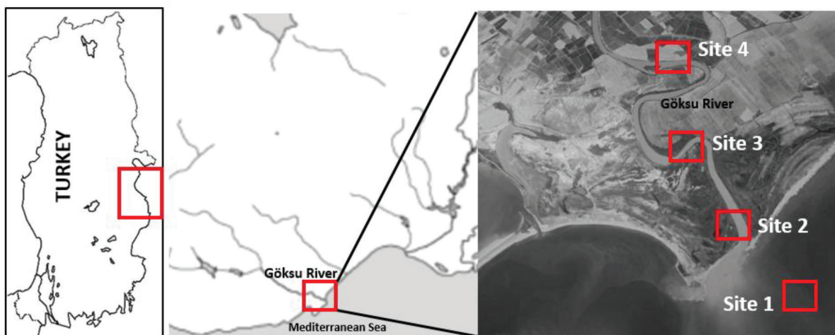
Fig. 1. Map of Turkey showing the sampling sites in the Göksu River estuarine zone.

The fish community was characterised using either the species richness (S) – the total number of