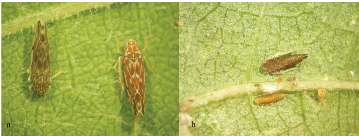
Fig. 2. The North American leafhopper of grapevine Erasmoneura vulnerata adults (a) and larvae (b).

consisting in 0.5 l plastic bottles baited with apple vinegar and red wine mixtures from commerce (3:2). The bottles had 6–8 holes with a diameter of about 3–5 mm in the upper half for the flies' entry. One trap per plot set up in the vines foliage was used. The insects were collected at the end of the trap activity. To check the berries for the presence of the fly, about 2 kg of grape bunches per monitored site were brought to the lab and placed on filter paper in glass vials closed with gauze. The samples were kept at around 25°C, RU 65% and 16:8 photoperiod.