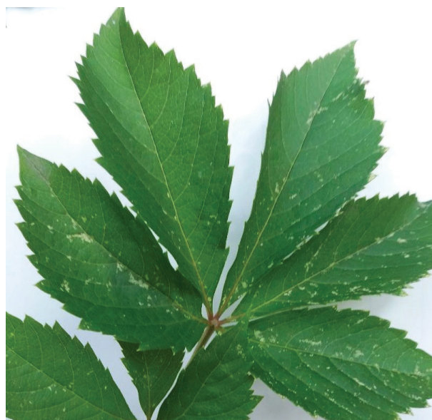
Fig. 4. Erasmoneura vulnerata , attack on the leaves of Parthenocissus quinquefolia .

to brown with nuances of red and with light green legs (DUSO et al. 2005), flattened dorso-ventrally at vertex and thorax.