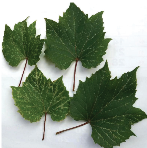
Fig. 3. Erasmoneura vulnerata , attack on the leaves of wild Vitis .