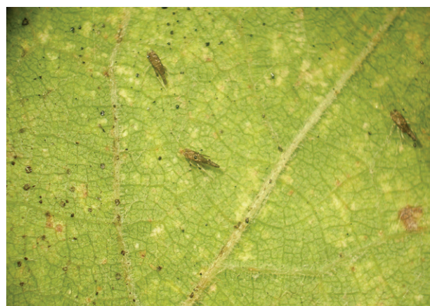
Fig. 5. Erasmoneura vulnerata , black spots of excrements on the vine leaves.

Presence of P. cyclops was confirmed every year during the three-year survey (in 2016, 2017 and 2018) at 39 out of the 80 investigated plantations (Table 1), out of which 11 plantations were in the